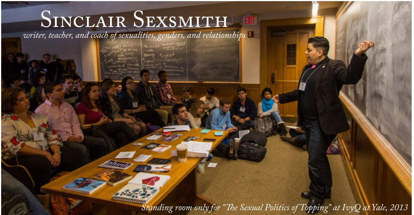
Standing room only for "The Sexual Politics of Topping" at IvyQ at Yale, 2013

writer, teacher, and coach of sexualities, genders, and relationships