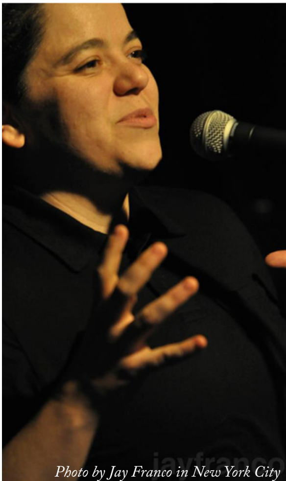
in New York City